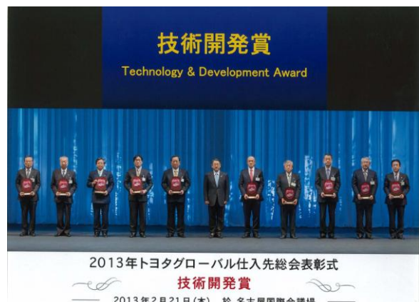
< The supplier who won "Technical Development Award" >